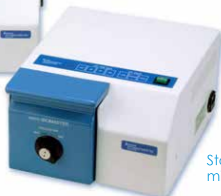
Stomacher® 80 microBiomaster