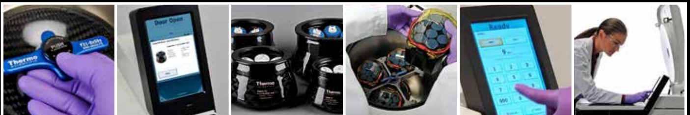
Auto-Lock™ rotor exchange